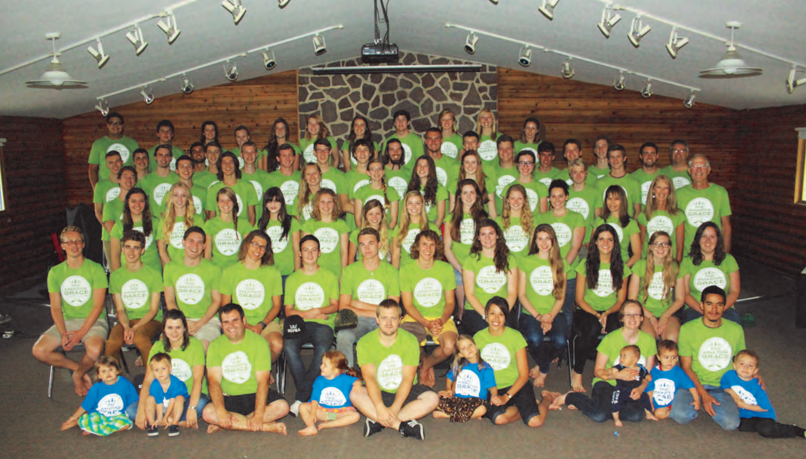
2014 RED ROCK BIBLE CAMP SUMMER STAFF

Red Rock Bible is located in the heart of the Whiteshell Provincial Park, 17km North of Rennie Manitoba on Hwy #307, approximately 150 km N.E. of Winnipeg and Steinbach. GPS coordinates are: N49 58.503 W95 30.952